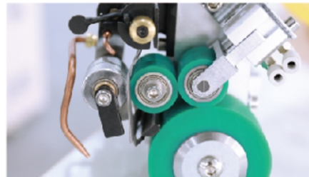
自动化剪带 Automatic cutting tape